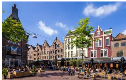
The City of Arnhem