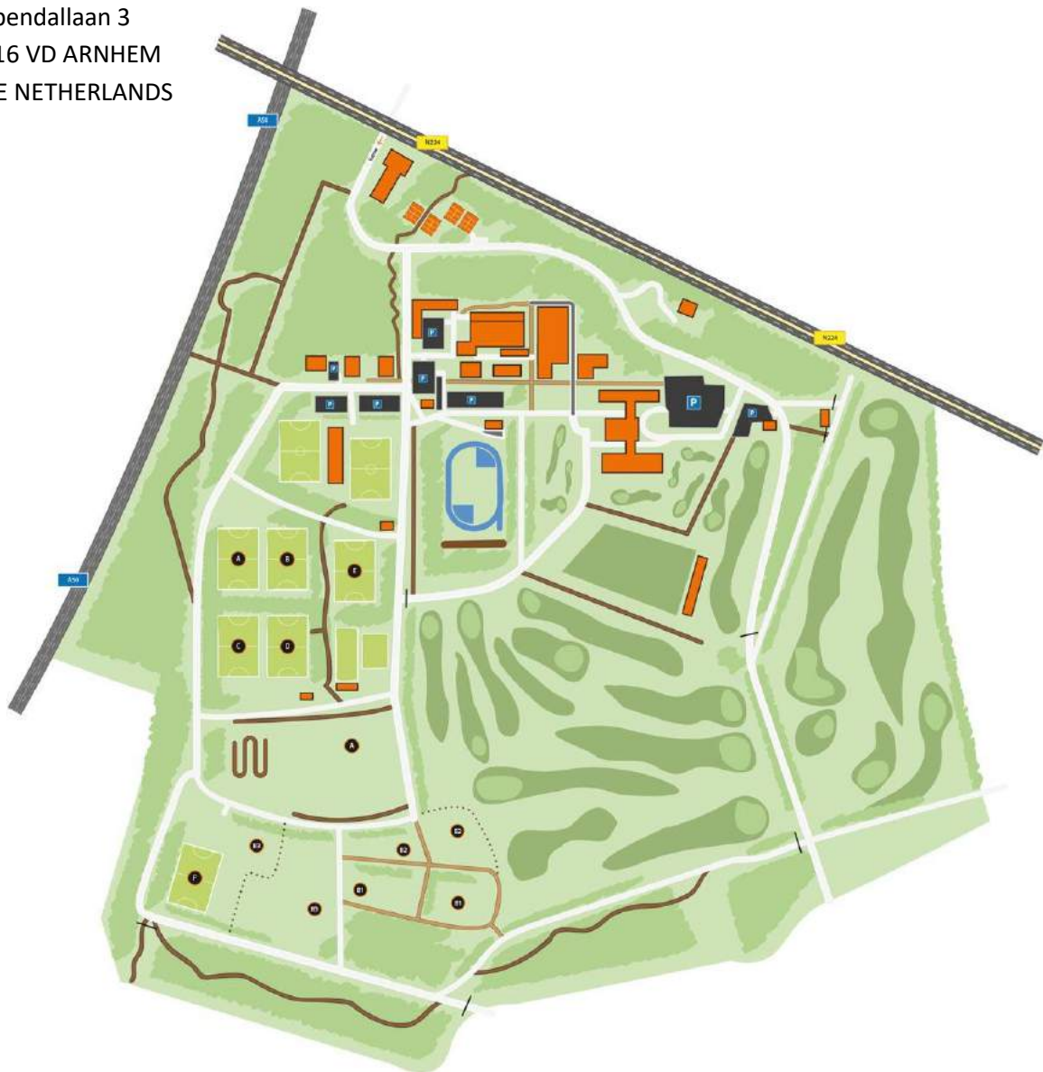
Ground plan Sport Centre Papendal

Papendallaan 3 6816 VD ARNHEM THE NETHERLANDS