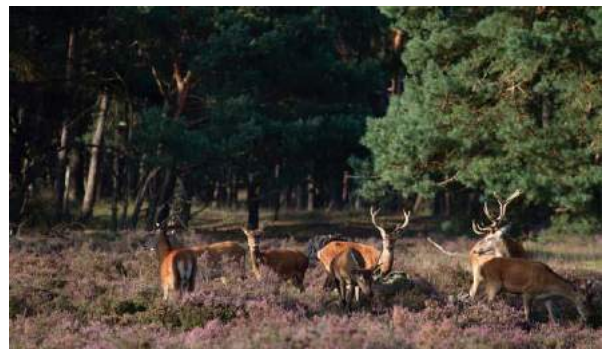
National Park De Hoge Veluwe